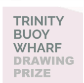
Illustration / June 13, 2022 (deadline)